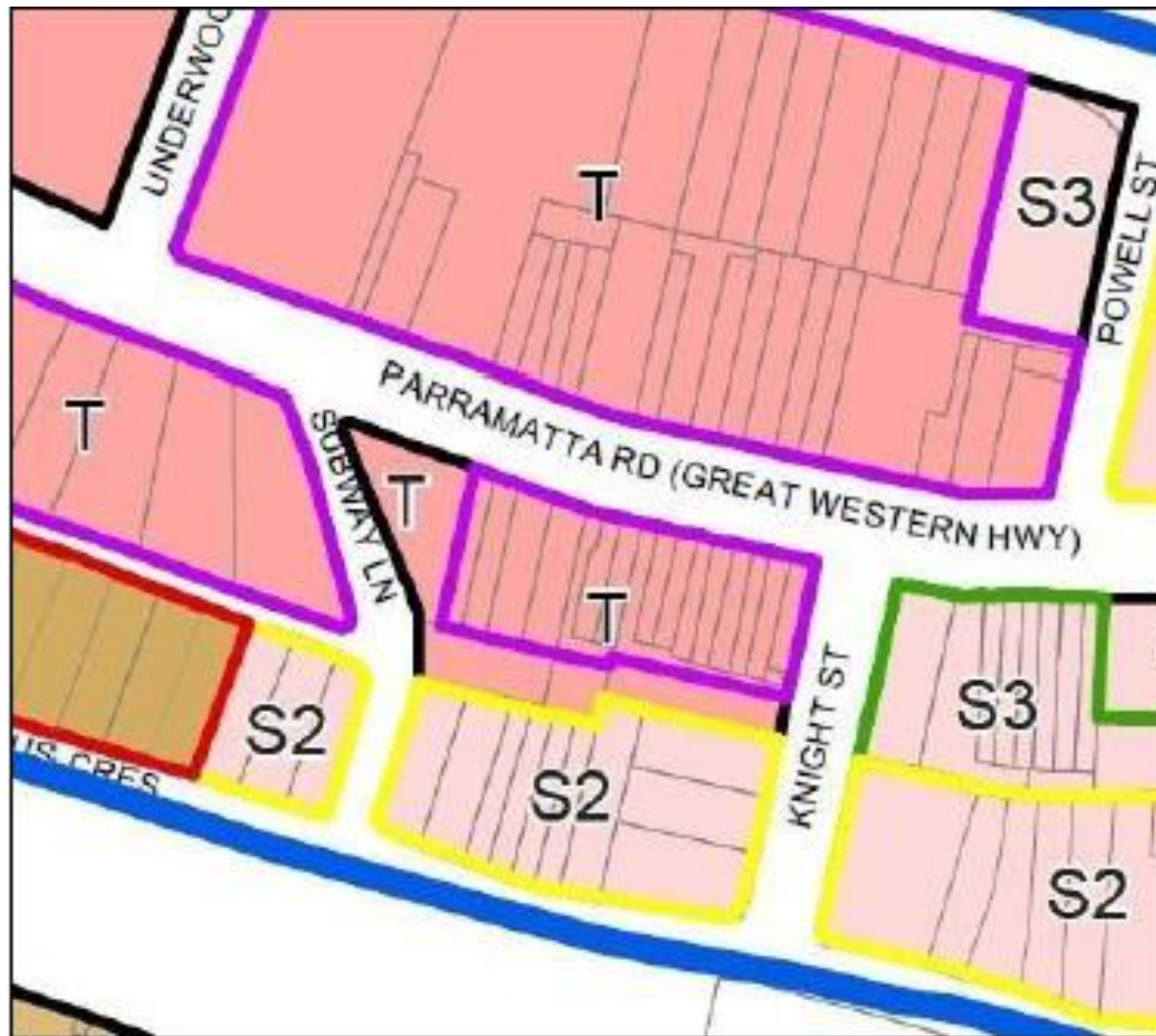
Current FSR Map