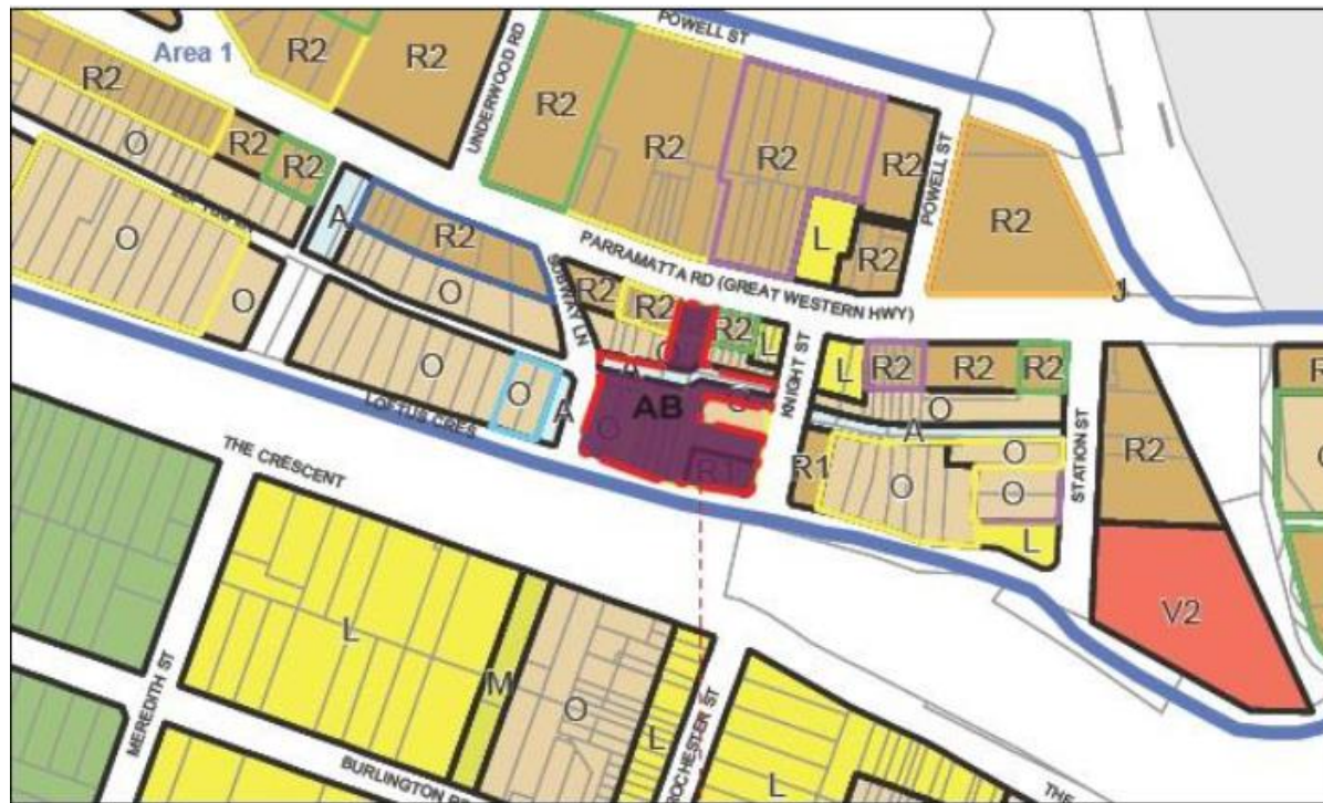
Height of Buildings